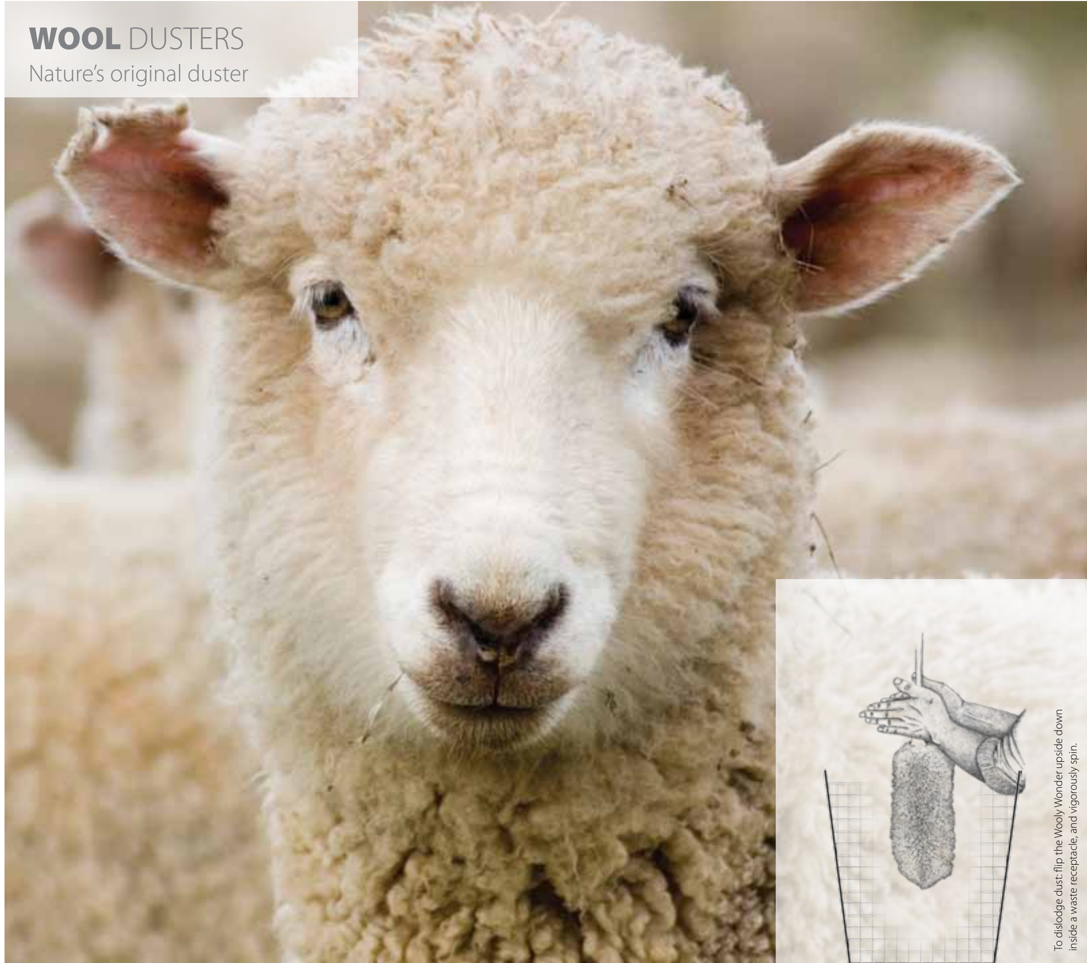
To dislodge dust: flip the Woolly Wonder upside down inside a waste receptacle, and vigorously spin.